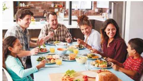
(Some content used with permission of the Northern Advocate, some content from health advisory sites, including New Zealand and Australia)