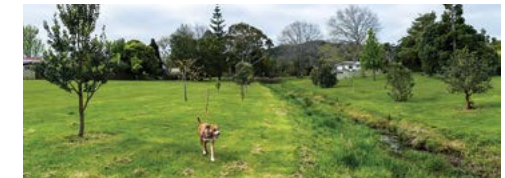
Beasley Park, Tikipunga