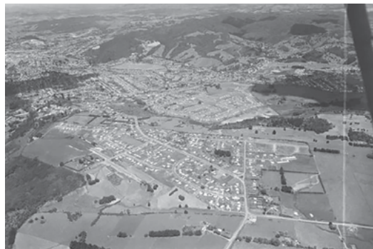
Tikipunga, Whangārei.

Haere mai and welcome to the spring edition of the Otuihau News. The biggest news in this spring edition is certainly the development of the new football hub as covered on page 4. Tikipunga's birth... we managed to find this photo from the Turnbull Library to share with you, taken in December 1965 by Whites Aviation. It shows Tikipunga with Whangārei in the background. Kamo is just out of the shot. What a lot has changed since then! If you have good memories of Tikipunga in these early days, please drop us a line and tell us about it - we're sure that the youngsters would love to know more about what life was like then. Nga mihi, the Otuihau team