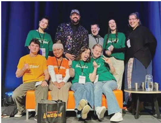
Young volunteers form Whangārei Youth Action Group and plan Youth Action For Community Holiday Programme