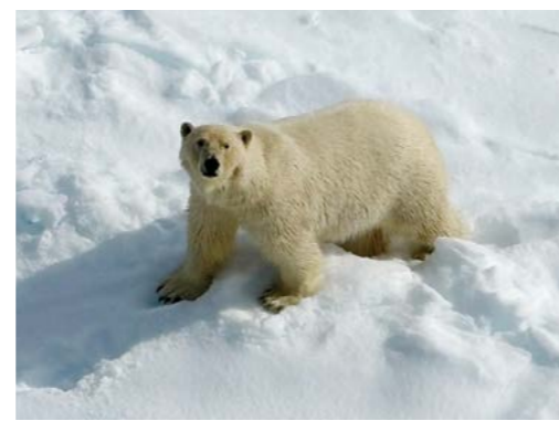
Polar bear staring up at Le Commandant Charcot Expedition Cruise vessel