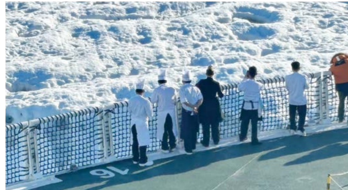
A stunning moment expedition ship glides by the ice shelf

Antarctica is a land of silence and ice, where the wildlife is curious rather than cautious. Penguins waddle right up to inspect your boots, elephant seals lounge along the shoreline, and whales surface close to the zodiacs, seemingly unbothered by our presence. There is no human habitation here, only research stations, so the wildlife reigns