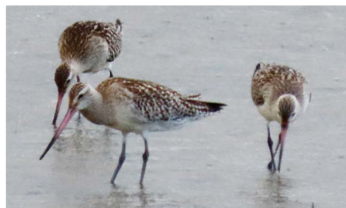
Bartailed Godwits on the Onerahi foreshore