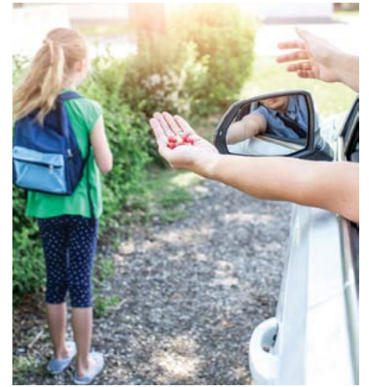
Run to safety when approached by strangers in a car

Local authorities are encouraging parents to reinforce basic safety tips with their children. These include walking with a buddy, sticking to well-populated routes, and being cautious of anyone who tries to approach or speak to them. Parents are also advised to make sure their children know what to do in the event of a stranger approaching, such as immediately returning to a trusted adult or a safe, public space.