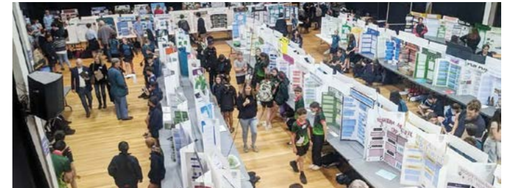
Central Northland Science and Technology Fair

At a national level, commentators continue to describe New Zealand as a potential economic powerhouse, with regions like Northland playing a vital role in food production, tourism, and renewable energy. For Whangārei, this could mean new opportunities for local business, alongside the challenge of ensuring growth is sustainable and community focused.